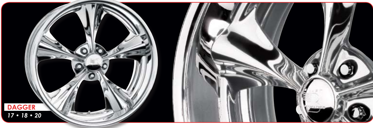
DAGGER 17 • 18 • 20