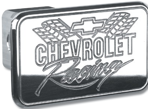
#211020 Chevrolet Racing™ $24.95