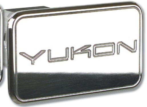
#211720 Yukon® $24.95