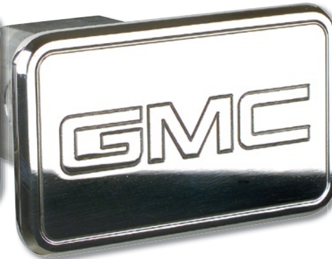
#210420 GMC® $24.95