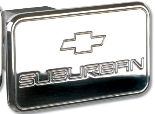
#211520 Suburban® $24.95