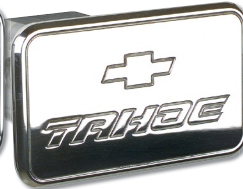
#211620 Tahoe® $24.95