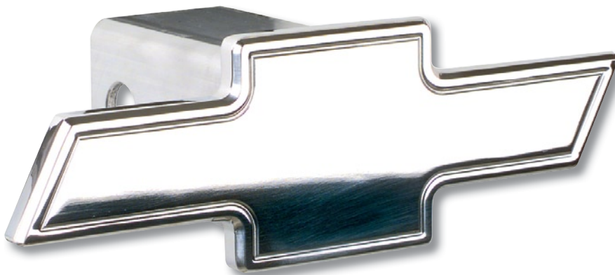
#210120 Bowtie Cutout $24.95